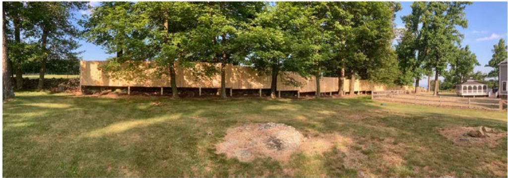
Fence degrades Historic Significance of Stone Wall behind it and obstructs Scenic View