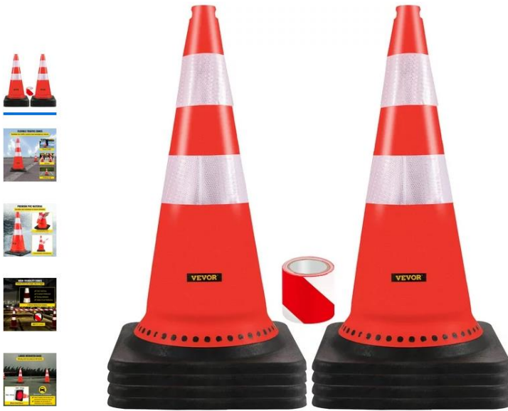
Roll over image to zoom in