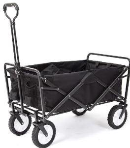
Roll over image to zoom in