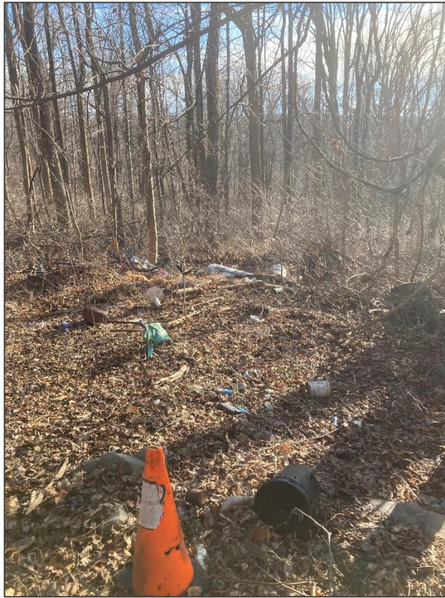
Photo 5. General debris.