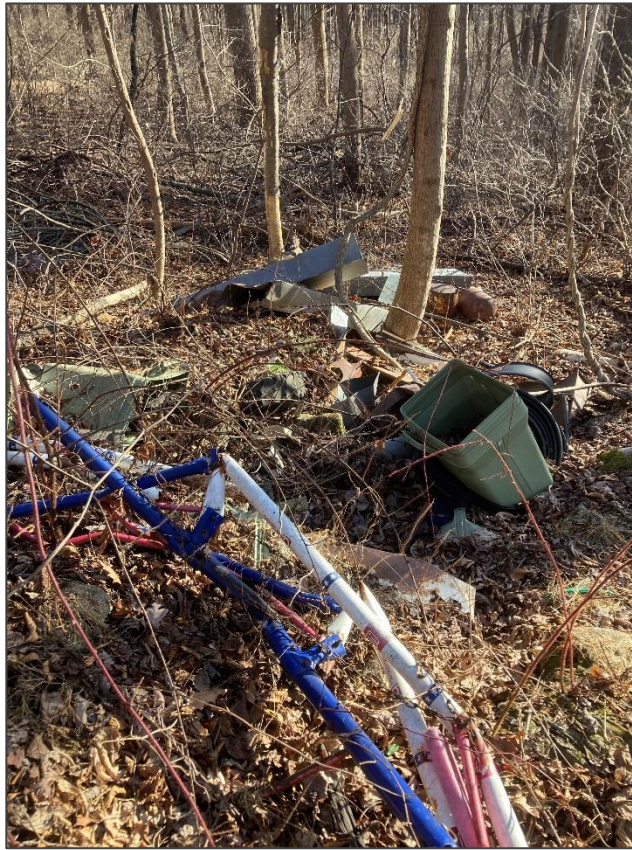
Photo 7. General debris.