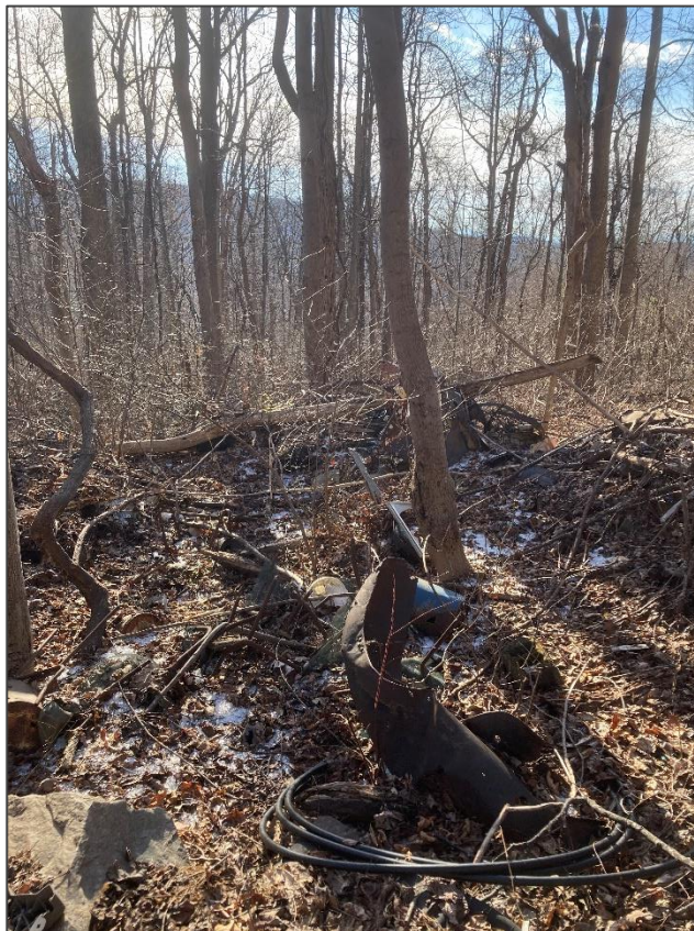
Photo 6. General debris.