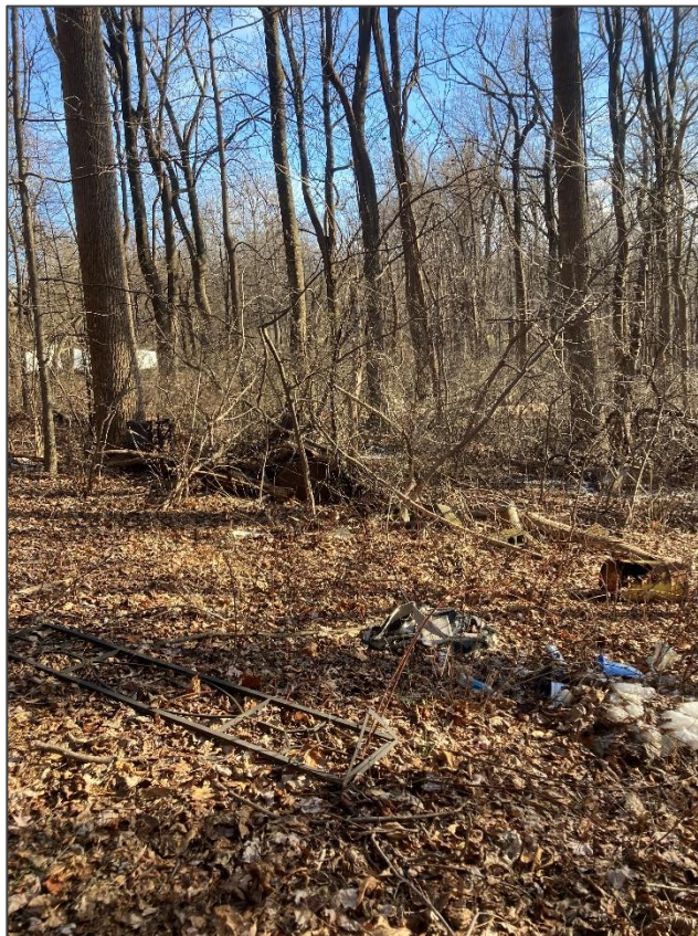
Photo 4. General debris.