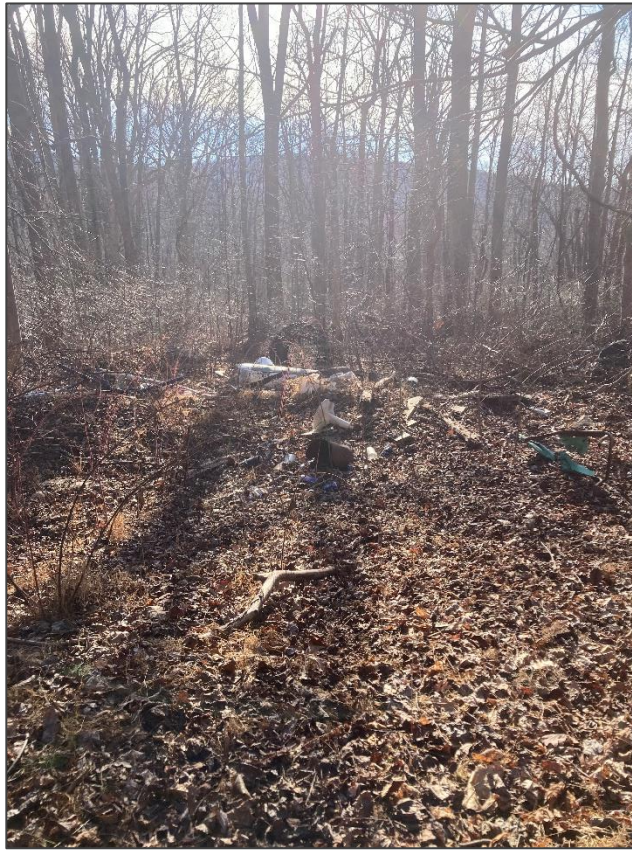
Photo 3. General debris.