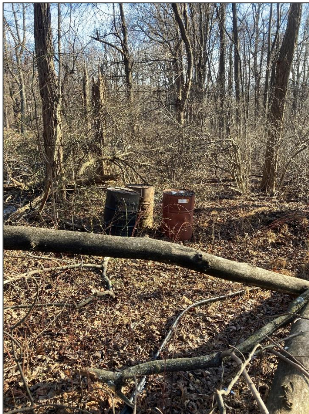
Photo 2. Partly full oil drums.