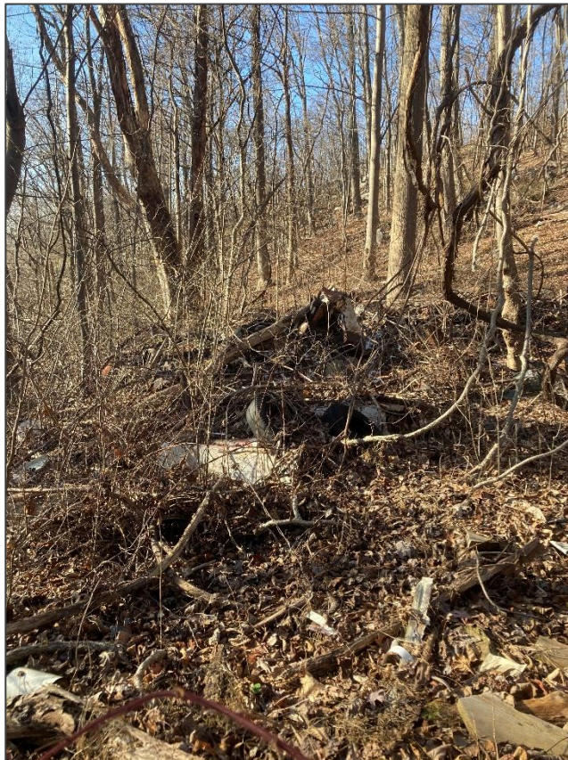
Photo 8. General debris.