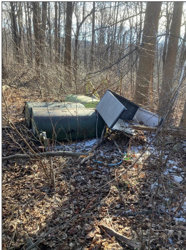
Photo 1. Empty oil tanks with residue.